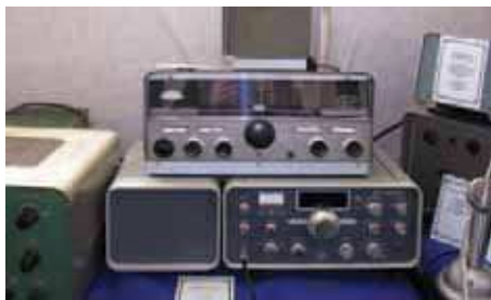
Top - KW77 receiver, bottom - KW2000D, one of only two ever made. From the RSGB museum collection. Photo: G1MFG.

The final variant was a completely different beast – the KW2000CAT. This was a 4 channel crystal controlled transceiver, with a pair of 6146Bs in the PA, driven by a 12BY7A. The rest of the circuitry was solid state, with fairly